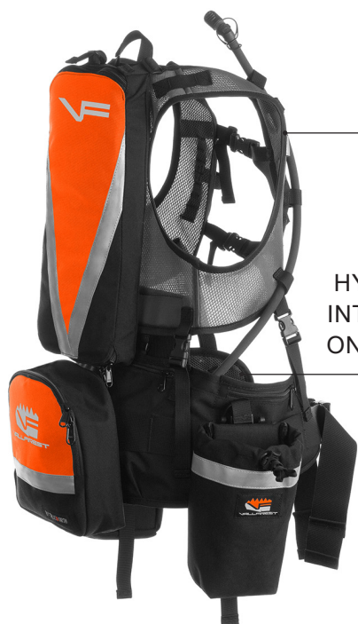
ERGONOMIC AND BREATHABLE HARNESS