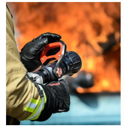
Leader Nozzles are available in 3 different sizes: