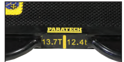
EASY AND ACCURATE POSITIONING

The MAXIFORCE® AIR LIFTING BAG is a thin, strong, molded envelope available in 14 different sizes.