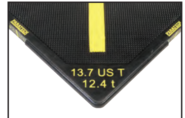
HIGH VISIBILITY MARKINGS