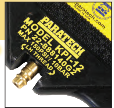
RECESSED AIR INLET FOR ADDED DURABILITY