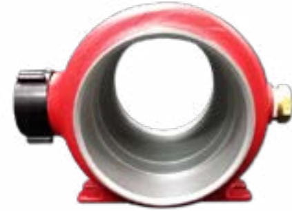
Fire Hose Washer

Remarkably effective in cleaning all types of dirty caked-up fire hose. No adjustments of flow or pressure required. Once in operation the washer works automatically at full efficiency.