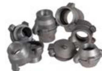
Quick Connect Couplings