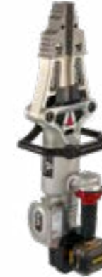
AMKUS ION 2.0 iS280 Spreader

The short length of this tool allows it to fit into confined spaces that other competitors tools can't access.