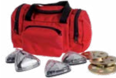
Lightman Light Kits

Lightman Light Kits - Highly effective LED light modules designed for temporary warning in a wide range of situations and applications. The Compact Cordura® Duffel Bag stores five light modules for ready access.