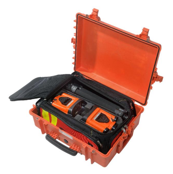
Leader SENTRY Wireless DOUBLE in its back pack and optional hard case