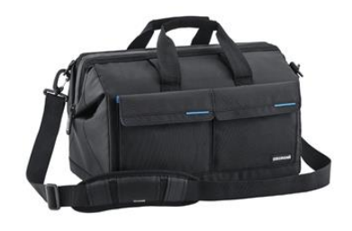
Leader SENTRY Wireless SINGLE in its transport bag